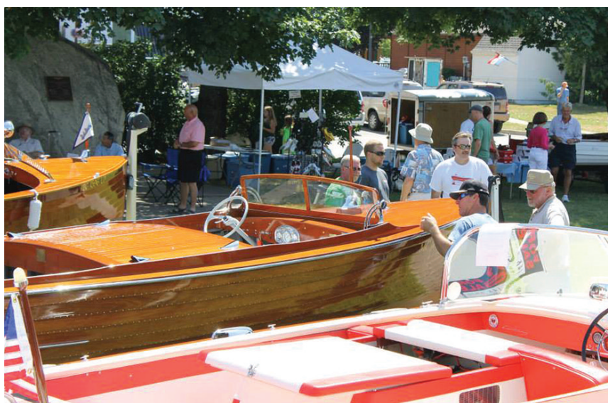
The South Arm of Lake Charlevoix and downtown East Jordan will be filled with classic boats and cars and a Micro Brew Beer Tent as the popular South Arm Classics takes place Saturday, July 8 from 10am-3pm in East Jordan. The Classic Car Show will award the Top 40 cars, Peoples Choice, Kids Choice, Director's Choice and Best of Show.