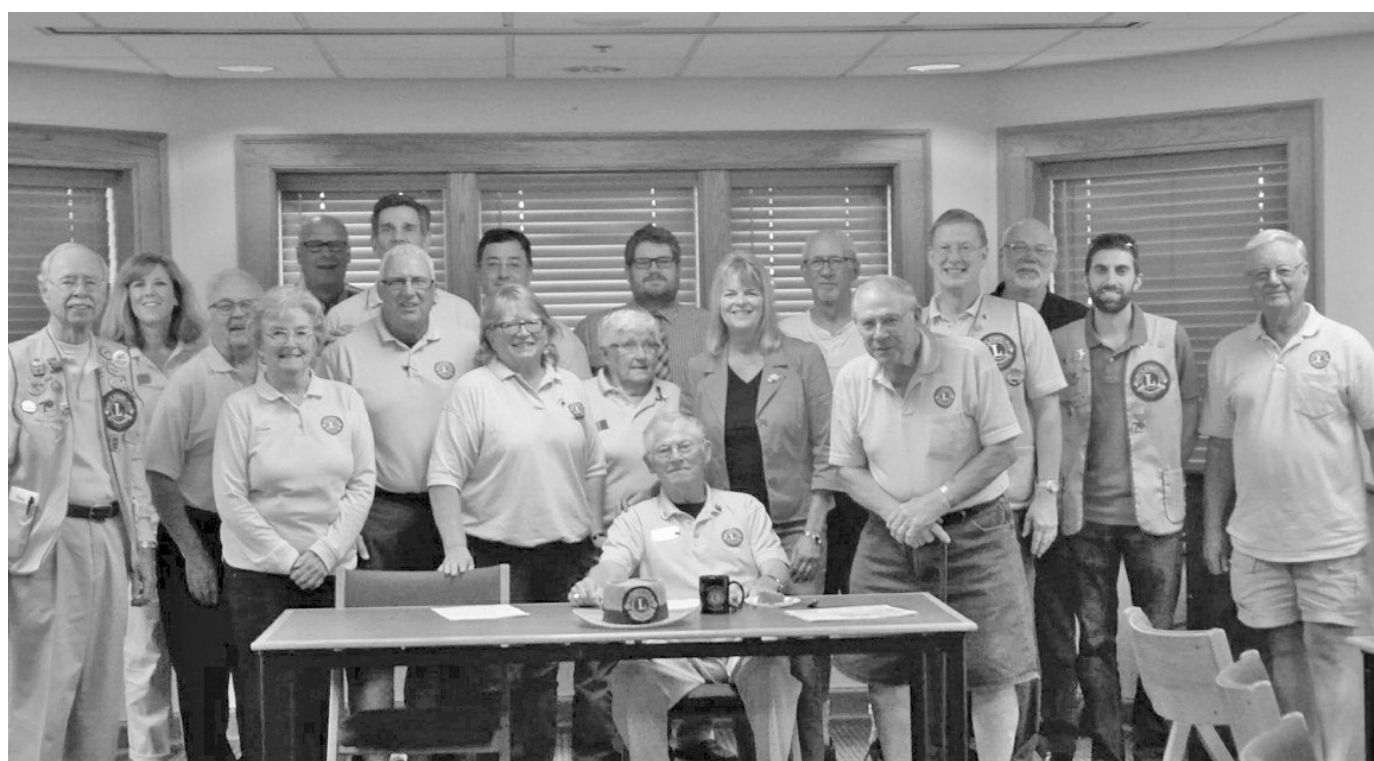
Capping off the 100th anniversary of Lions Club International and the 50th anniversary of the founding of the Boyne Valley Lions Club in 1967 a special ceremony was held inducting officers for 2017-2018 on Wednesday, June 28th.