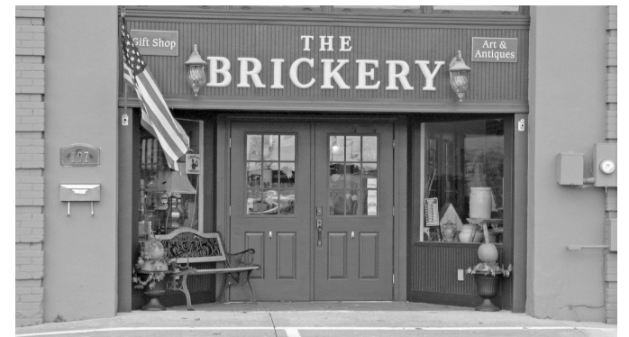
Shoppers in downtown Grayling will find two floors of treasures embracing a wide array of fascinating items at The Brickery. The store, located at 107 Ottawa in downtown Grayling.

located at 107 Ottawa in downtown Grayling, is open Monday through Friday from 10am-5:30pm, Saturday 10am-5pm, and Sunday from 11 am to 3 pm. Visit www.the-brickery.com or call 989-348-8999 for additional information.