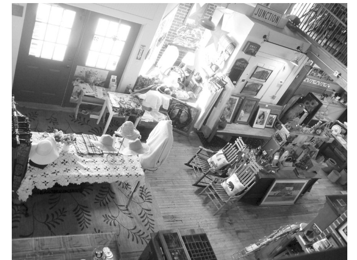
Established by Linda Nickert in June of 2007, items offered throughout the approximately 1,000 square feet of retail space in this historic building cover just about any interest or gift idea.