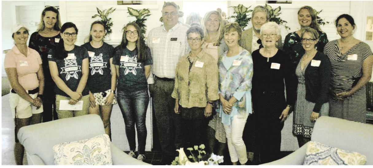
Last week at the Little Harbor Point Golf Club, eight organizations were granted a share of Hestia's 2017 gifts: a total of $38,500.

Last week at the Little Harbor Point Golf Club, eight organizations were granted a share of Hestia's 2017 gifts: a total of $38,500. One of Hestia's founding members, Sujo