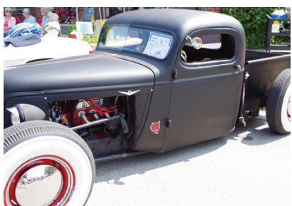
The South Arm Classic Boat & Car Show is presented by East Jordan True Value and hosted by East Jordan Lions Club.