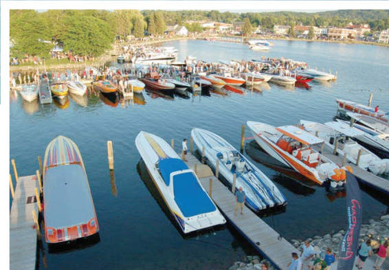
The poker run showcases 120 high performance boats from all over the country, roaring through the waters of Lake Charlevoix and Lake Michigan on a 130-mile excursion in search of the best poker hand.

The best poker hand will be announced on Boyne City Main Street's Facebook page, and will be awarded a grand prize basket which included $50 in Chamber