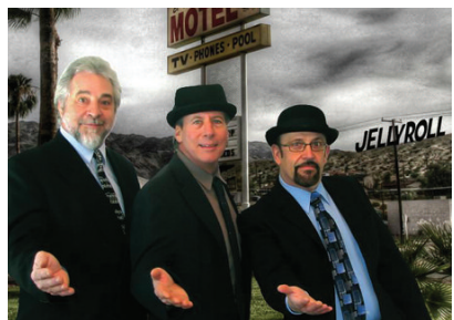
The Jelly Roll Blues band will be among the live music performers at the first annual East Jordan Brew Fest on July 8.

The Classic Car Show will award the Top 40 cars, Peoples Choice, Kids Choice, Director's Choice and Best of Show. Vehicle entry fee is $20 per entry. The event will also feature live music throughout the day. Bring your lawn chairs and blankets and enjoy great music on the lawn and shade of Memorial Park.