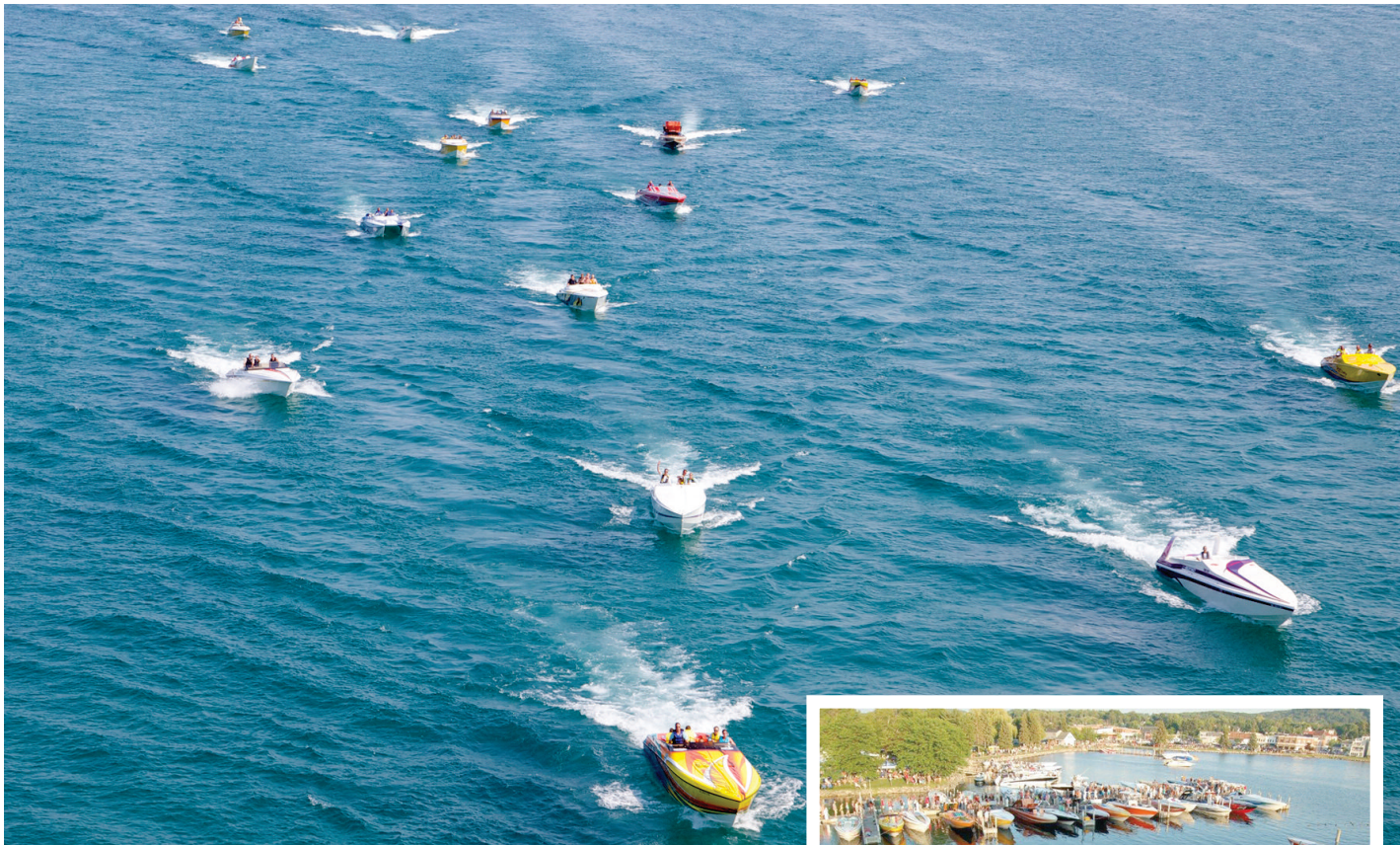
Bigger than ever, the 14th annual Boyne Thunder Poker Run brings speed, thunder, and excitement to Northern Michigan on July 7 and 8 in Boyne City.

For more information and for a list a exhibiting artists please contact the Charlevoix Area Chamber of Commerce at 231.547.2101 or visit www.charlevoix.org .